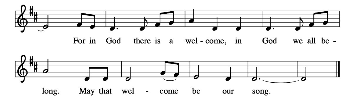
God, We Gather as Your People (continued)