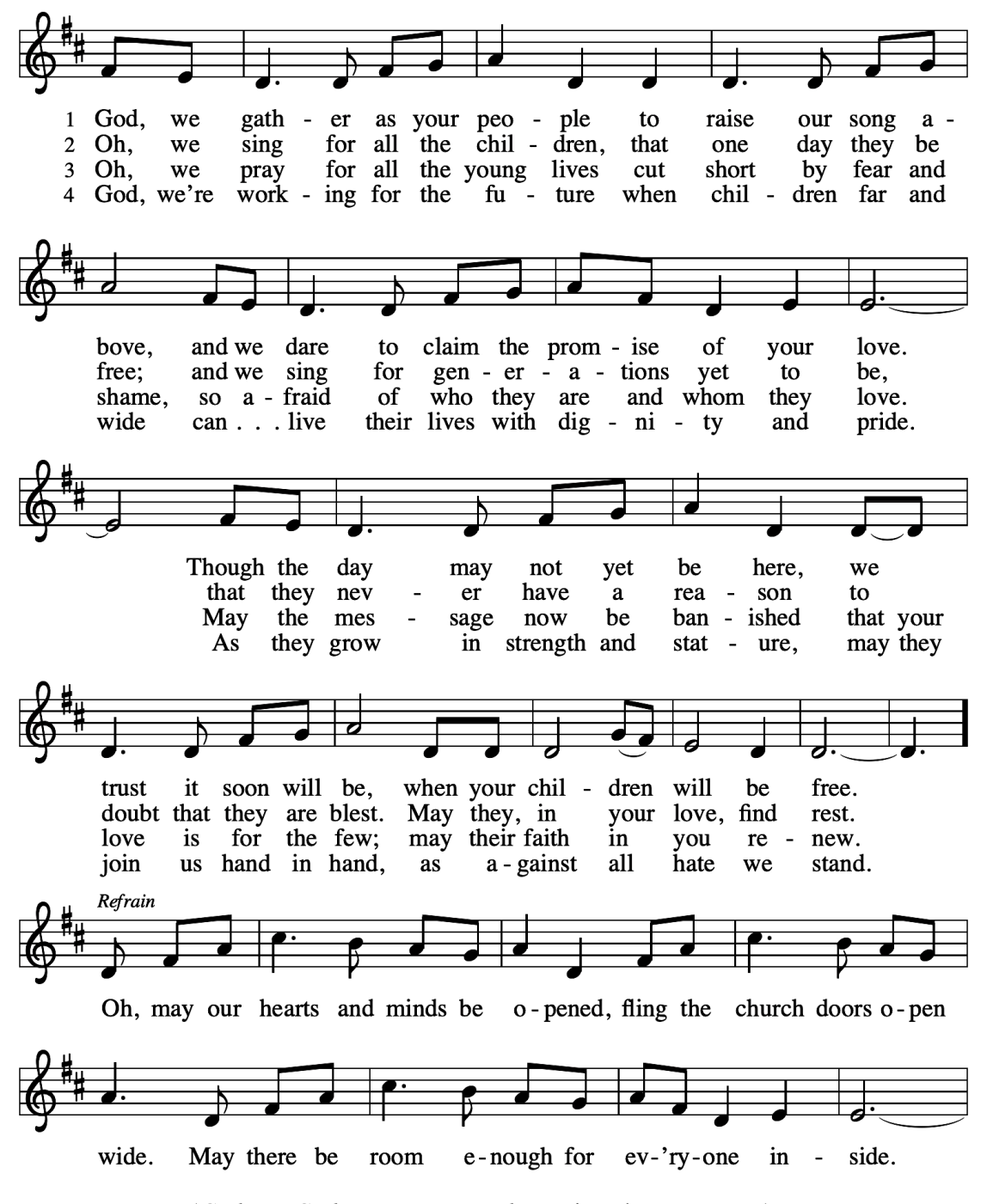
(God, We Gather as Your People continued on next page)